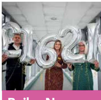
Boiler News 18-19, 23