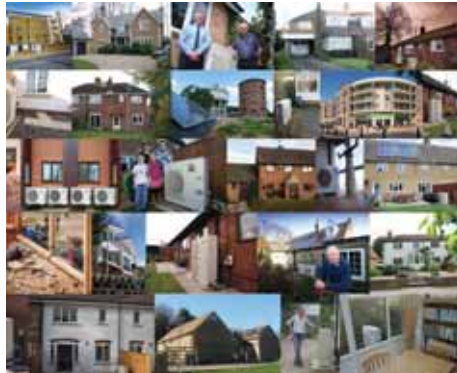
Mitsubishi Electric is holding a series of free seminars to highlight the integral role that heat pump technology has to play in the commercial and residential heating sectors, with dates in December, January and March – www.mitsubishielectricvents.co.uk/ecodanseminars

SPFH4 conditions widen the monitoring by including all auxiliary power consumption and this gives a much clearer indication of overall system performance. Fifteen of the Ecodan sites also achieved an SPFH4 average of 2.98 across the winter of 2011-2012 – one of the coldest on record for decades, and seven of the sites achieved an average of 3.04.