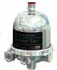
Clean, air-free oil with the Tigerloop Bio model