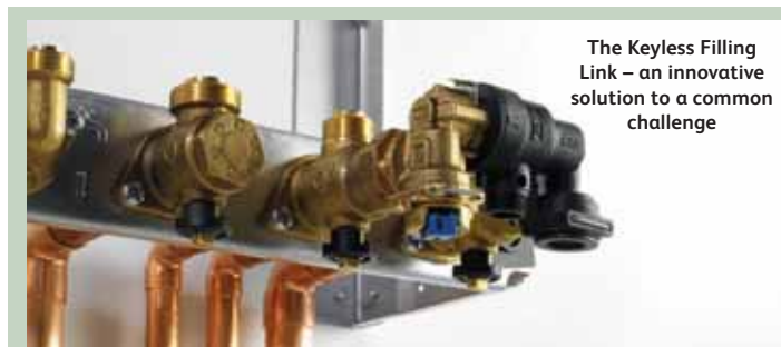
The Keyless Filling Link – an innovative solution to a common challenge