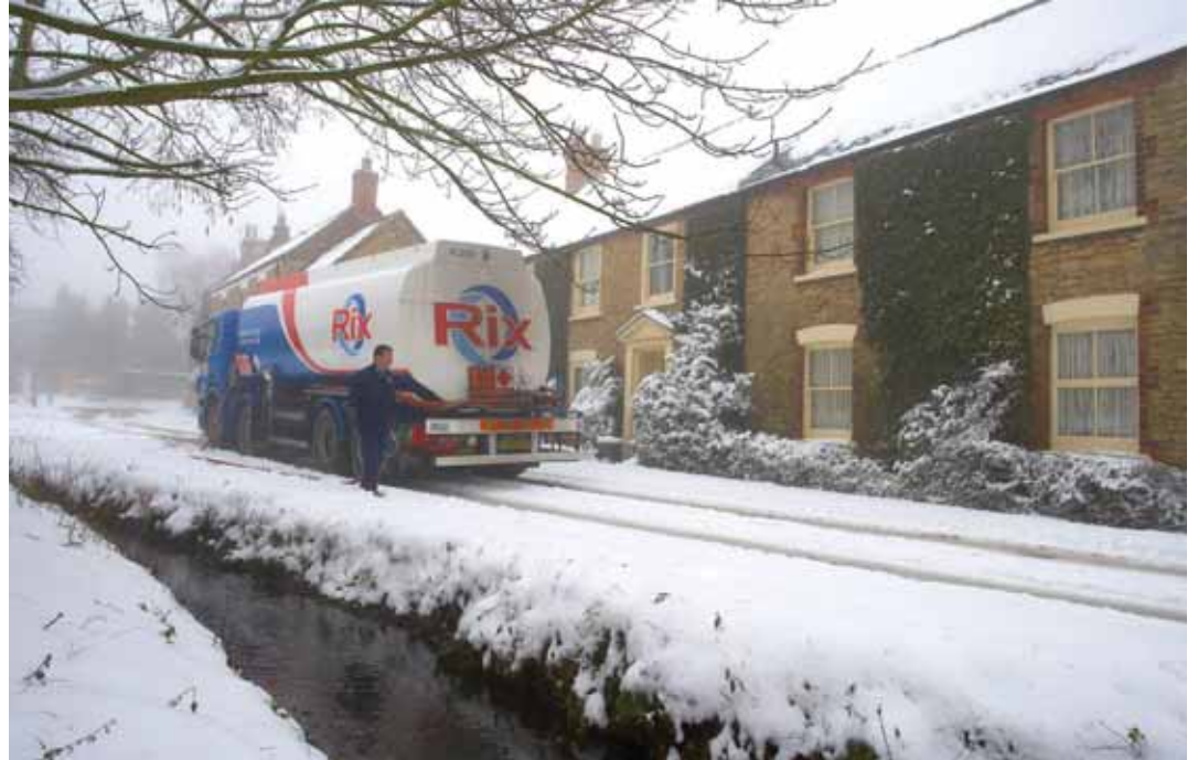
Rix Petroleum is promoting the Oilsave campaign on its website and via social media

The regional media campaign will continue throughout the winter and will support and reinforce the messages in the Oilsave flyers that technicians and FPS fuel distributors are handing out. Watson Petroleum is the latest fuel distributor to get actively involved in the campaign and their support will help many more oil customers to get the