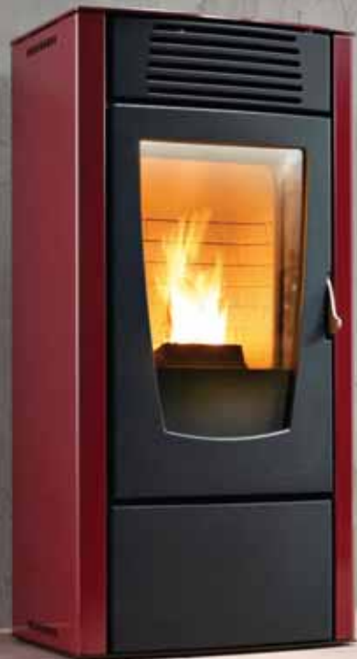
Dalia Pellet Stove