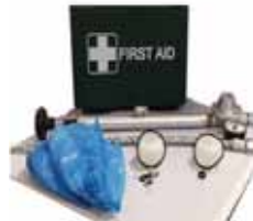
This first aid kit is just one of the new products in the latest OFTEC Direct catalogue

OFTEC Direct was set up in 2003 with just one product – oil line warning tape – The range has grown considerably since with new products being added all the time.