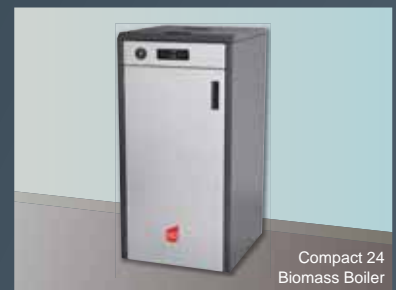
Compact 24 Biomass Boiler