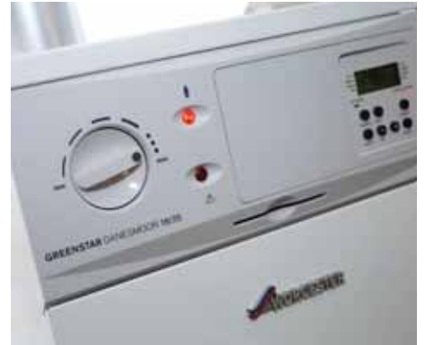
Upgrading the UK's existing oil-fired boiler stock to the new Greenstar range

"This new series also future proofs the product's efficiency levels in anticipation of the forthcoming Energy Related Products Directive, underlining our commitment to