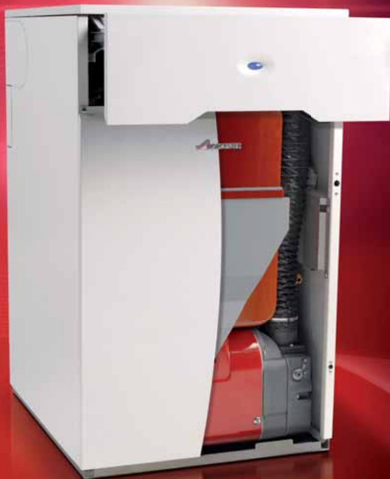
Greenstar Heatslave II combi and Heatslave II External combi series (12/18kW, 18/25kW, 25/32kW)