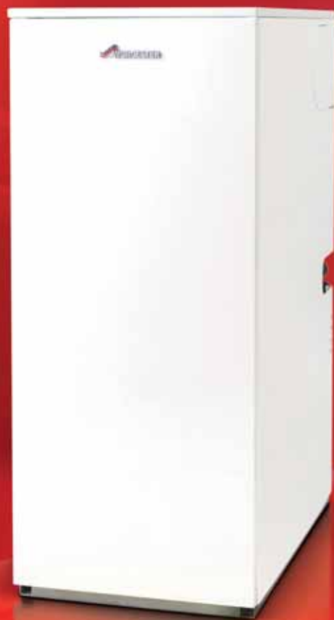
Greenstar Danesmoor System, System Utility and System External series (12/18kW, 18/25kW, 25/32kW)