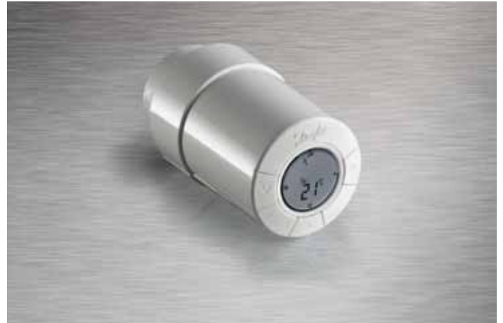
The Danfoss ECI thermostatic radiator valve

Despite the well documented benefits of heating controls, there is a reluctance to upgrade with the anticipated disruption to a property's fabric often cited. Having to channel out walls and rip up flooring can be off-putting but this is overcome by many of the