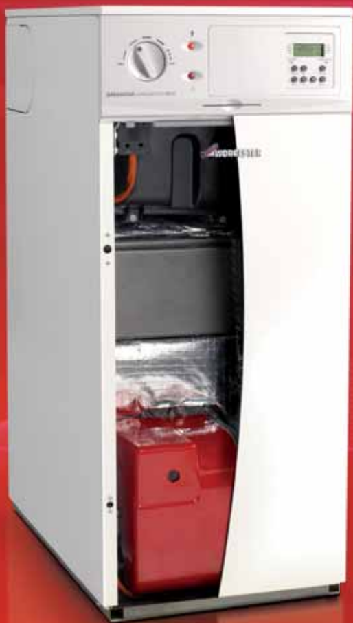
Greenstar Danesmoor regular, regular Utility and regular External series (12/18kW, 18/25kW, 25/32kW)