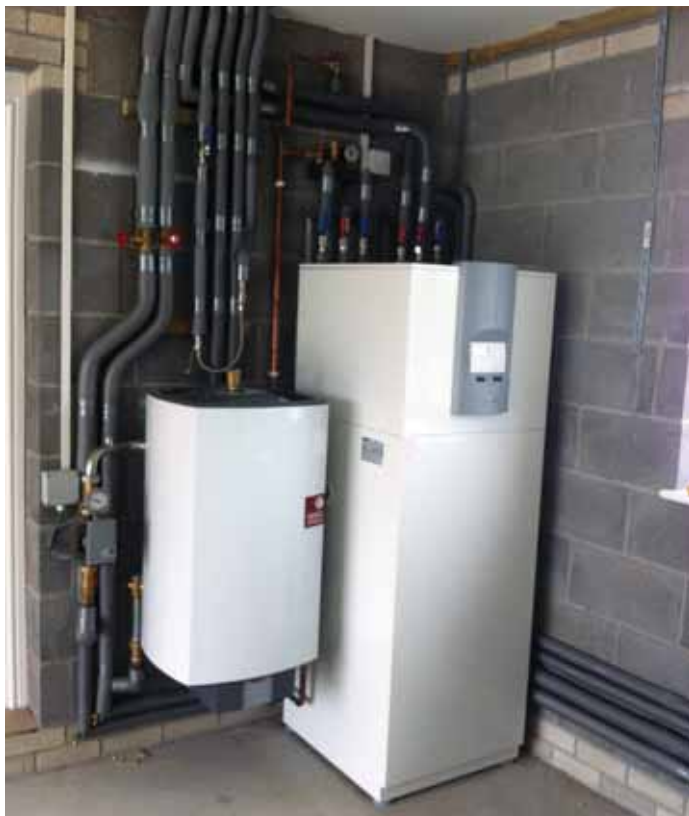
The Stiebel SG Anglesey Webster 2 – the company's WPL 15/25 air source heat pump was also a runner-up in the Green Innovation category at the same awards

With a three phase supply every home has three lines of electrical energy linked up to their heat pump and the load is shared between the three lines. In single phase systems the three lines generated by the turbine at the power station are not run into each house. Instead different properties are supplied by just one of the lines. This, of course, means a lot less wiring and a cheaper system to install, but does mean that there is more risk of the supply being unbalanced by single, power-greedy users.