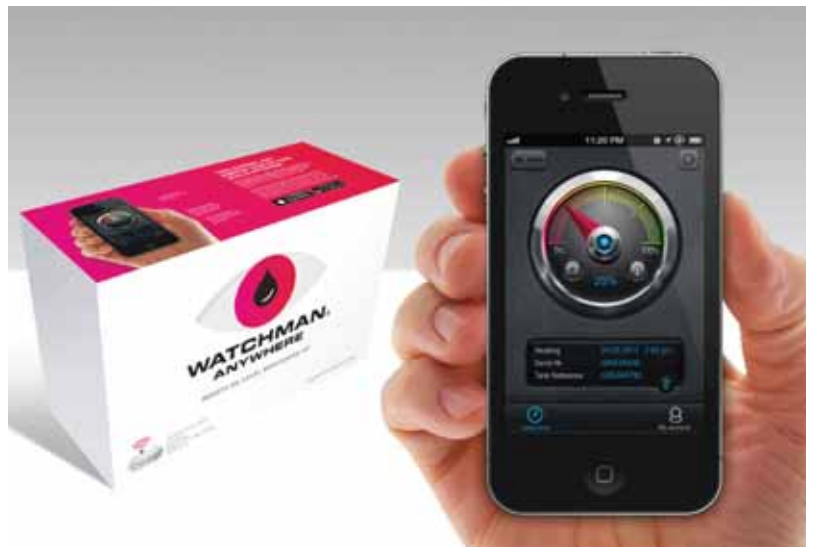
Find out what's in your oil tank – anytime, anywhere – with the new Watchman Anywhere

Users can access the free iPhone and Android app that displays tank information and oil levels. First-time users will benefit from a 12-month free subscription. See also page 24. www.watchmananywhere.com