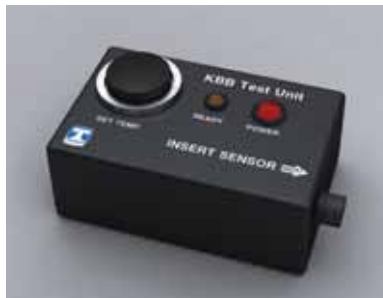
The KBB fire valve – the only OFTEC approved fire valve with a three-year warranty

Teddington Appliance Controls has been supporting the oil boiler market for over 40 years. The company provides essential supplies for oil boiler servicing such as the KBB – the only OFTEC approved fire valve with a three-year warranty. Other key products include the OFV1 oil tank shut-off valve with a filter and the KBT 1000 universal test unit for all standard fire valves from 65 to 120oC. www.tedcon.com