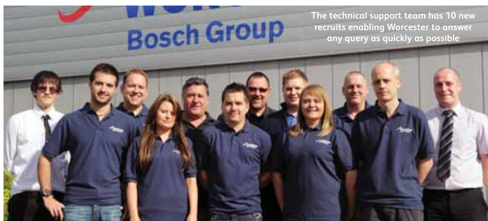
The technical support team has 10 new recruits enabling Worcester to answer any query as quickly as possible

Open 6 days a week, including bank holidays call 0844 892 3366 or e-mail technical.enquiries@uk.bosch.com .