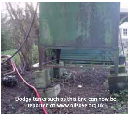
Dodgy tanks such as this one can now be reported at www.oilsave.org.uk