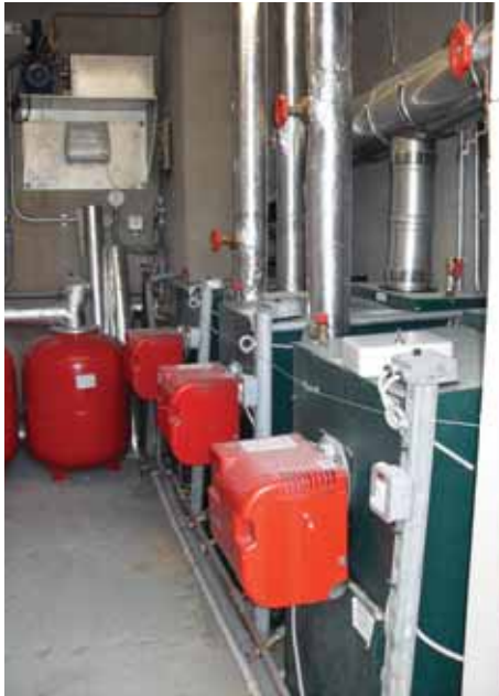
These three Firebird 100kW boilers in a cascade system are now reliably and consistently meeting the increased heating needs of a school

In an energy upgrade to replace an old 180kW cast iron boiler, Firebird Heating Solutions has recently completed the installation of three 100kW Enviromax Popular Boilerhouse condensing oil boilers.