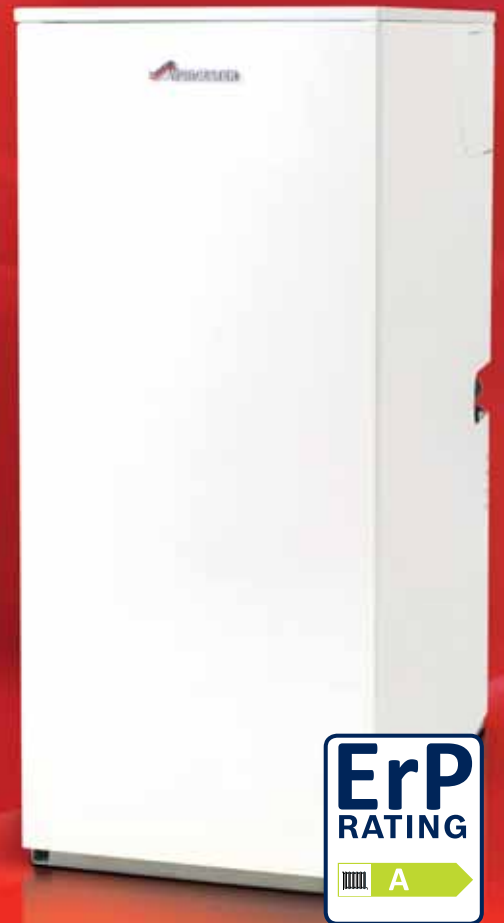
Greenstar Danesmoor System, System Utility and System External series (12/18kW, 18/25kW, 25/32kW)