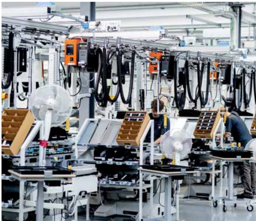
The Danfoss production line in Nordborg, Denmark