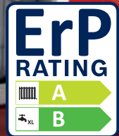
Greenstar Heatslave II combi and Heatslave II External combi series (12/18kW, 18/25kW, 25/32kW)