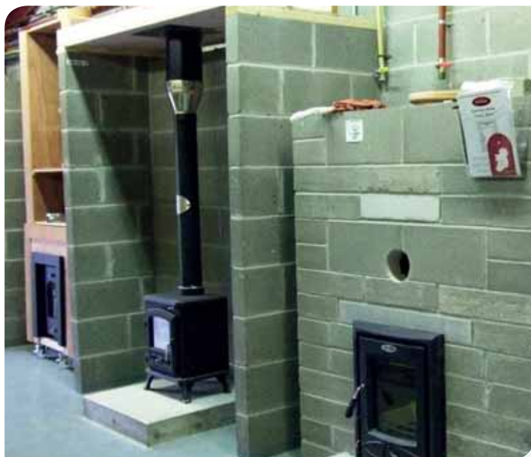
METAC's training rooms feature the most up-to-date equipment and materials

METAC Training, based in Mountrath, Co. Laois, Ireland, is now offering dry and wet solid fuel stove installer courses in addition to its solid fuel awareness training.