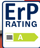
Greenstar Danesmoor regular, regular Utility and regular External series (12/18kW, 18/25kW, 25/32kW)